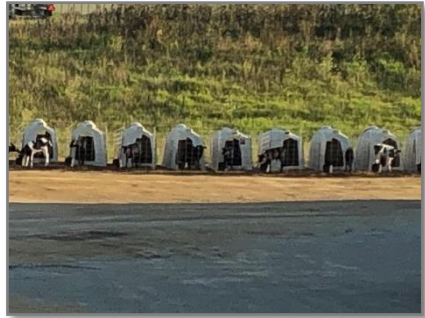
The next generation

We are filling nearly 3 tankers a day and each tanker hold 53,000lbs