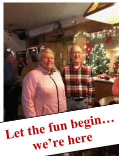
Let the fun begin... we're here