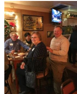
Who Us? Innocent!