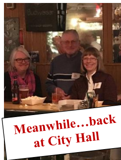
Meanwhile...back at City Hall