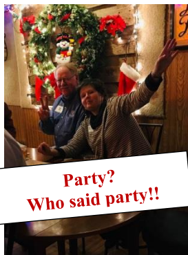
Party? Who said party!!