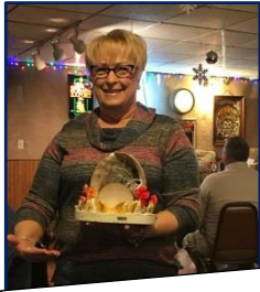
2019 Keeper of Shelly