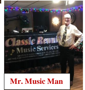
Mr. Music Man