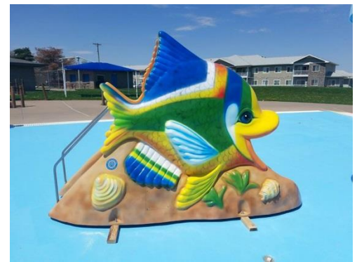
Tot Slide delivered to Platteville Aquatic Center as Legacy Gift from Optimist Club of Platteville.