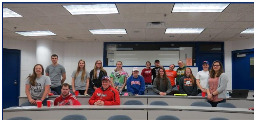
Chartered on March 19, 2018, 17 UW-P students formed the Platteville Student Optimist Club-Wisconsin.